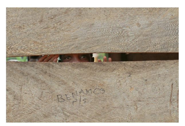
Benamos is a 15-minute drive from the village of Naigobya in the Bukooma Subcounty, which is part of the Luuka District.