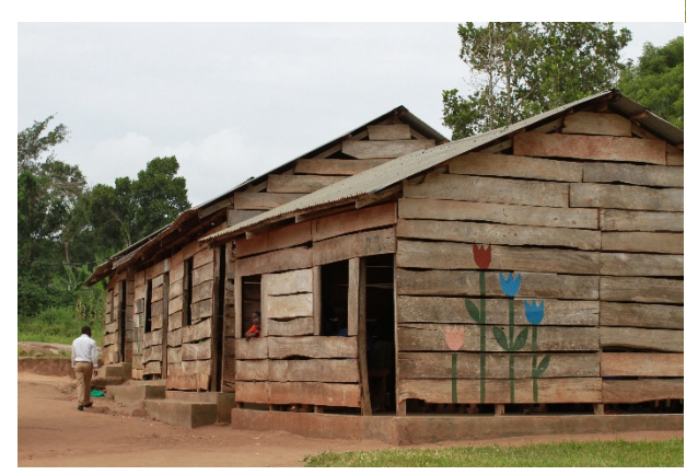
There are 13 teachers who oversee the education of 436 students. That's 35 students per teacher.

None of the 436 students board at the school. The 15-minute drive from town translates to about a 45-minute to an hour walk.